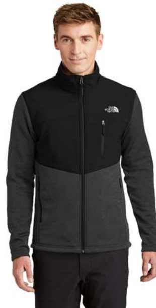
NEW The North Face® Far North Fleece Jacket. NF0A3LH6

Combining breathable mid-weight fleece with durable WindWall® stretch overlays, this travel-friendly jacket lets you explore new trails in comfort.