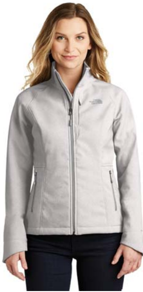
NEW The North Face® Ladies Apex Barrier Soft Shell Jacket. NF0A3LGU

Windproof with stretch, this iconic jacket offers the ultimate weather protection.